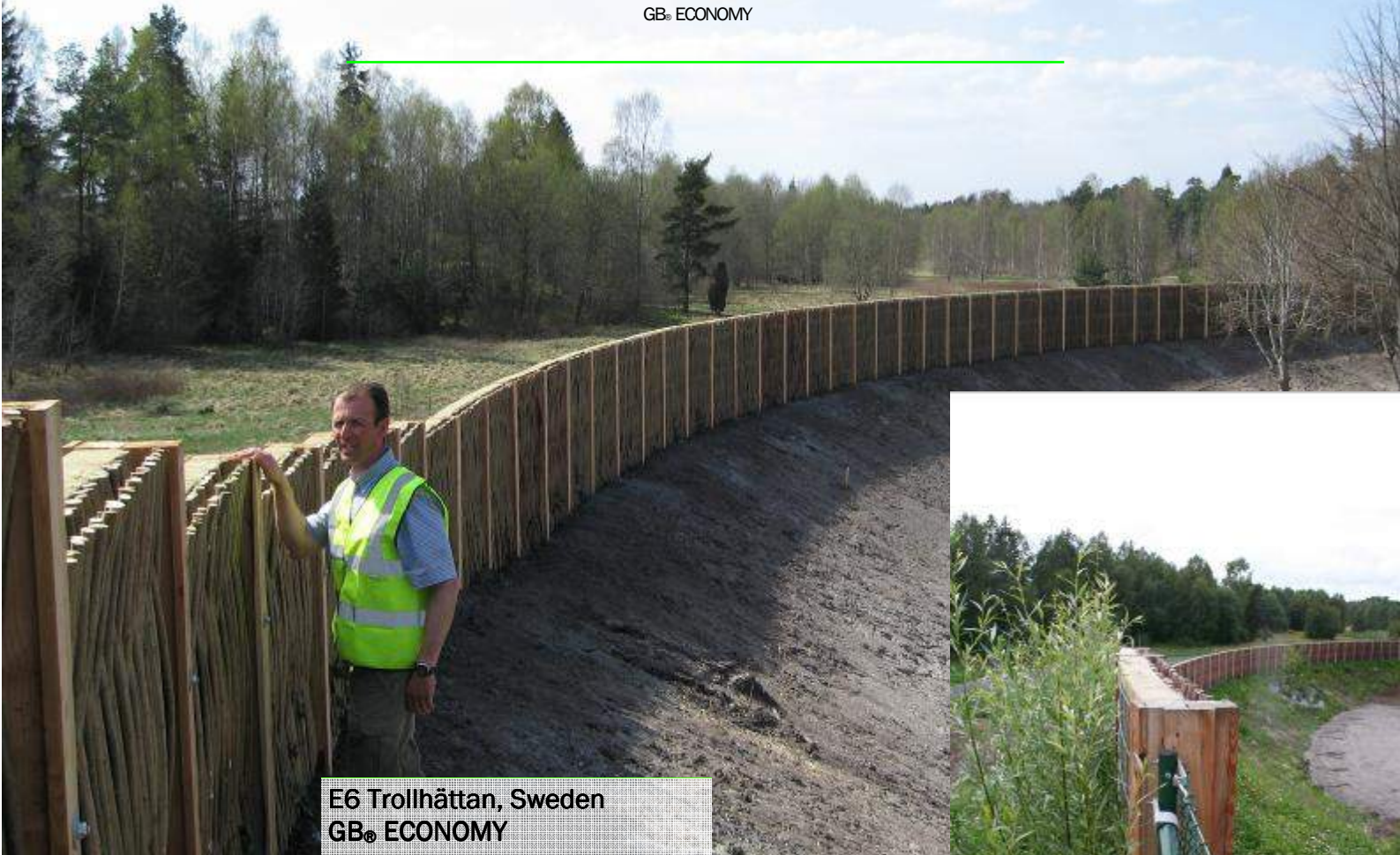
E6 Trollhättan, Sweden GB® ECONOMY

Noise abatement between new E6 and Kindergarten/school